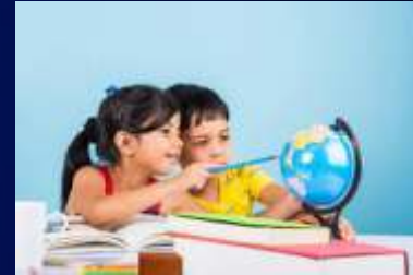
BEST SCHOOL EDUCATION